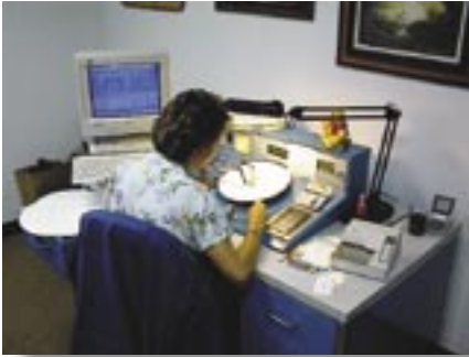
Chart recorders provide records of flow conditions, and must be “integrated” in order to accurately account for the gas volume represented on the chart. Chart integration involves retracing flow (differential pressure), static pressure, and

temperature recordings, then applying these results to the individual station parameters in order to determine gas volume.